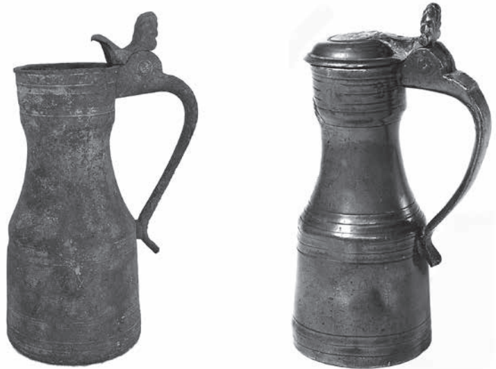
ILLUS 13 The two early 18th-century chopin tappit hens

1736'. It has been established that this couple from Newton, Midlothian were married in 1734 (Scotlandspeople online). It is not known, however, whether the engraving was