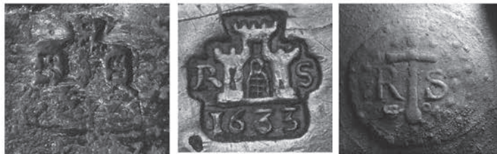
ILLUS 7 Left : Maker’s mark on the pint measure; centre : the mark as struck on the touchplate; right : the mark struck on the inside of the base

The half-mutchkin measure has no maker’s mark on the neck, and we are unable to tell whether there is a mark on the plug inside the base. The other two measures have remarkably clear makers’ touchmarks,