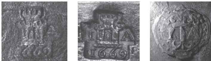
ILLUS 10 Left : Maker's mark on the Abernethie chopin measure; centre : the mark as struck on the touchplate; right : the mark struck on the inside of the base

The pint measure has the punched initials GW above RH on the lid, whilst the chopin is stamped C R and the half-mutchkin has the initials I K. In the 17th and 18th centuries it was common for domestic utensils to have ownership marks, probably to deter theft. Silver owned by the gentry was engraved with their arms. Pewter utensils more usually bore the owner's initials, either punched or engraved. The pint tappit hen has the initials of husband and wife, and this is something of a paradox in a warship. It seems likely that