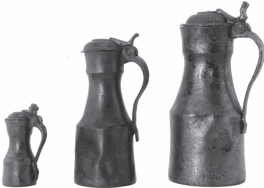
ILLUS 2 The three Swan tappit hens of half-mutchkin, chopin and Scots pint sizes

two other ships sank in a terrible storm on 13 September 1653, just a few metres off Duart Point. Her wreck was discovered by a naval diver in 1979, but the site was not properly excavated until 1992, when seabed disturbances put the wreck in danger of destruction. The subsequent excavation under Dr Colin Martin of University of St Andrews, uncovered a wealth of objects including cannon, the ship's binnacle, decorative carved woodwork and three tappit hen measures (Martin 1995: 15–32; Martin 1998: 46–66).