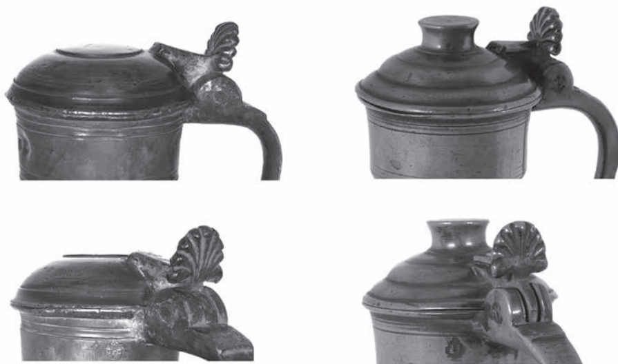
ILLUS 12 Side and rear views of the palmette thumbpieces of the Bute tappit hens