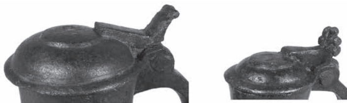
ILLUS 6 The heavy erect thumbpiece of the pint and the palmette thumbpiece of the half-mutchkin tappit hen (not to scale)

pewter, referred to as the ‘tapoun’, or more commonly, the ‘plouk’ (a Scots word for pimple). This indicated the level to which the measure was to be filled to hold its true capacity. The requirement for a tapoun was first mentioned in legislation passed by the Edinburgh Town Council on 31 January 1543 (ECA SL1/1/2). A further statute of 16 February 1554/5 (ECA SL1/1/2) is explicit: