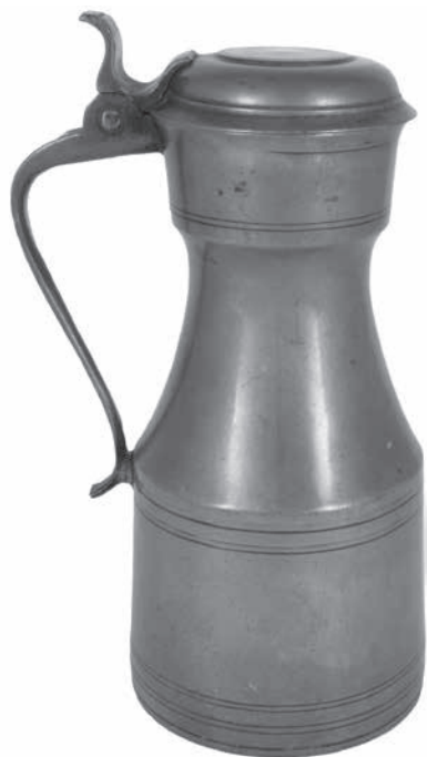
ILLUS 1 An 18th-century tappit hen

(Ingleby Wood 1904, plate XXII) dating to some time after 1669, when the maker became a master pewterer. It had never been subject to detailed examination and several interesting features had been overlooked. However, the recent discovery of three tappit hens from the wreck of the Swan , a small mid-17th-century warship, together with the recognition of four very early 18th-century examples, previously overlooked in private collections, enable us for the first time to piece together the early evolution of this eponymous Scottish measure.