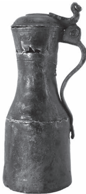
ILLUS 9 The chopin measure excavated from North Bridge, Edinburgh