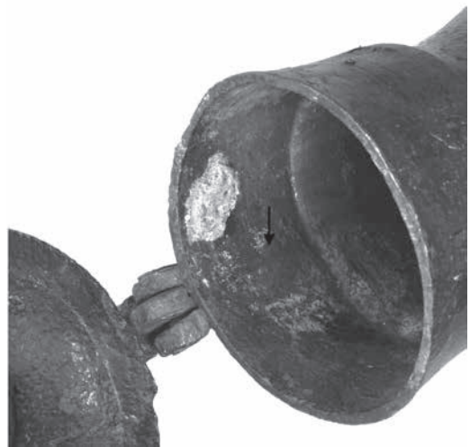
ILLUS 3 The vertical seam (arrowed)

recognisable tappit hen shape. The largest is a Scots pint, the second is a half-pint, or chopin, and the third is one-eighth of a pint, commonly referred to as a half-mutchkin