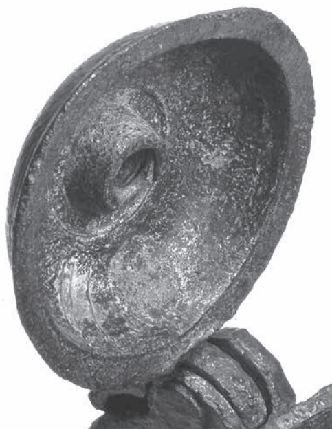
ILLUS 5 Inside of the lid of the pint measure to show the projection with screw threads

On the inside of the necks of the pint and chopin measures, to the left of the handle and just below the rim, is a blob of