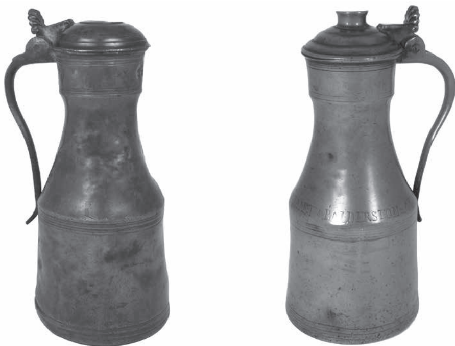
ILLUS 11 The two massive Bute tappit hens of Scots quart capacity