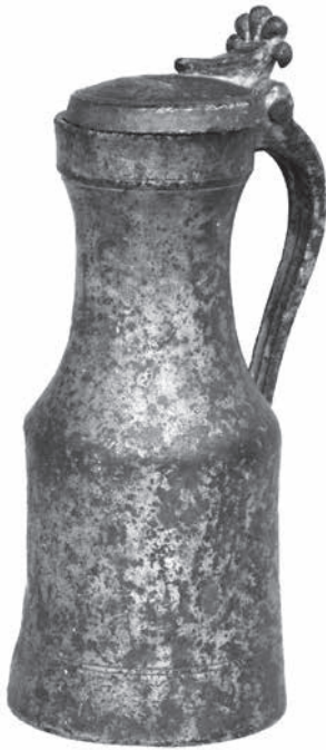
ILLUS 15 French flagon c 1600 from Rouen in Normandy

pewterers. In the 17th century, Edinburgh had extensive trade links, via the port of Leith, with northern European countries, but particularly with France and the Low Countries. Both of these countries appear to have influenced the form of the tappit hen measures. The body shape was very clearly derived from the north-west of France, from where extensive wine imports were made (Kay & Maclean 1983). Boucaud 4 notes that the ‘shouldered’ body form of early flagons and measures was peculiar to that part of France, and was not found elsewhere in Europe. The flagon from Rouen shown in illus 15 dates from c 1600, and the similarity of the body outline to the tappit hen form is immediately obvious.