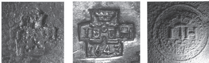
ILLUS 8 Left: Maker's mark on the chopin measure; centre: the mark as struck on the touchplate; right: the mark struck on the inside of the base

located to the left of the hinge, and directly behind the position of the plouk. The positioning of the mark dates back to 1554, when the statute of the Edinburgh Town Council referred to above, also called for, '... on the uter side of the tawpoun that the townis mark be thereon and makaris mark beside it' (ECA SL1/1/2).