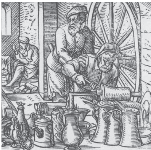
ILLUS 14 16th-century woodcut showing a pewterer finishing a flagon on a wheel lathe

base does not bear any mark. The hinge and thumbpiece are again both heavily cast. The thumbpiece is a palmette, but with the lobes less pronounced on the rear. One notable difference is that the attachment to the lid is now a thinner strap of metal that follows the contours of the dome of the lid. In this it anticipates the attachment seen in all later forms. The handle is of D-section.