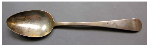
1962.0240.1072 Silver spoon upper surface Enlarge